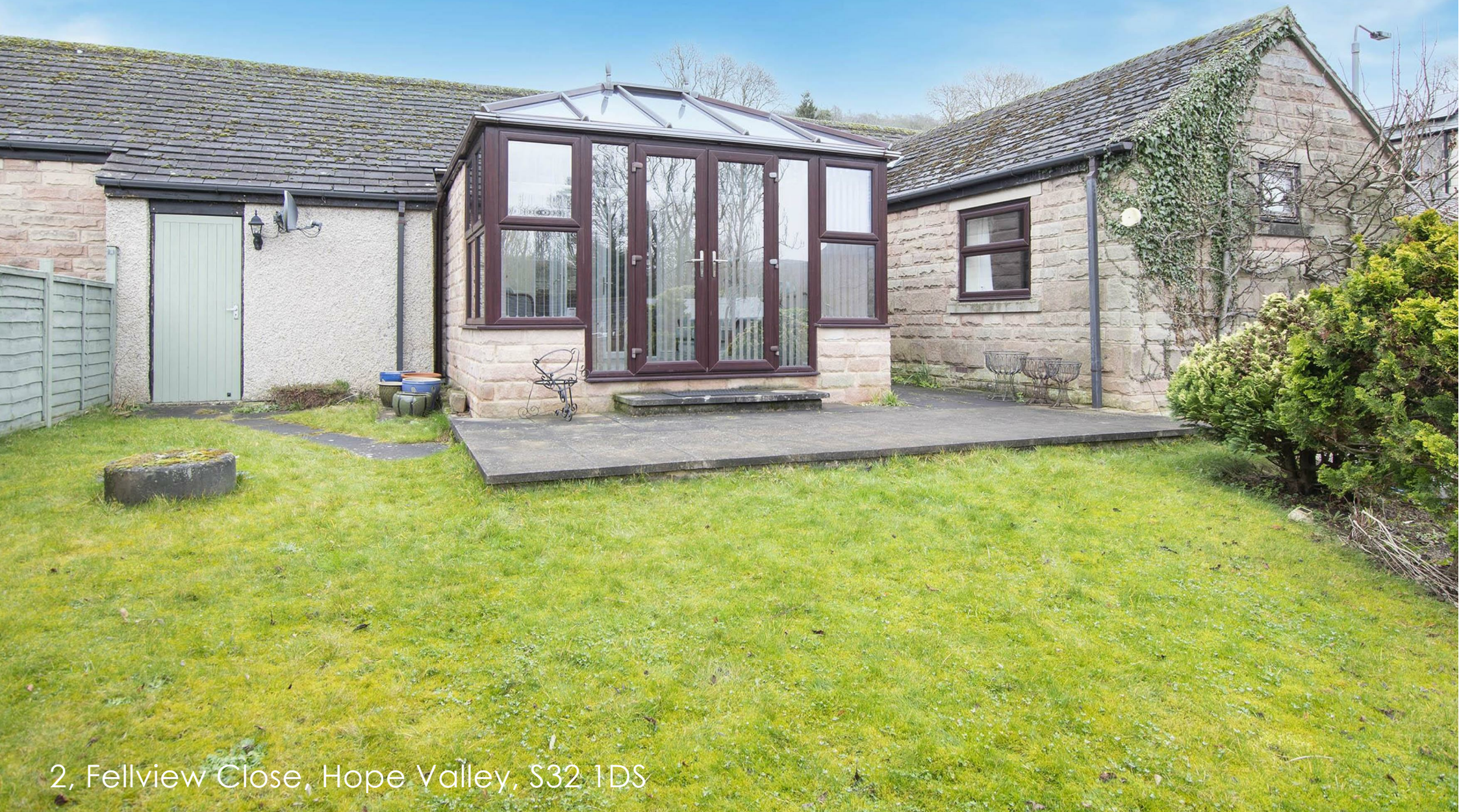
2, Fellview Close, Hope Valley, S32 1DS